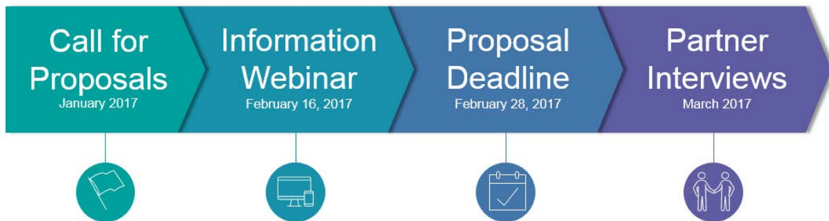
Figure 2: Partner Selection Timeline

In collaboration with the funder, the Nonprofit Center of Northeast Florida, the FL-DSSG program hosted a partner information session to provide potential program partners with information about the program and on how they could apply for project selection. Potential partners completed an online application and the FL-DSSG Directors conducted interviews with all applicant organizations. The final list of three organizations were selected based on the suitability of the project and partner based on the timeline, resources, and goals. All project partners were selected by April 28, 2017. Figure 2 provides a timeline of the partner selection process.