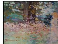
Hasty Angel Renée Faure ca.1990's Watercolor Gift of Pat Vail