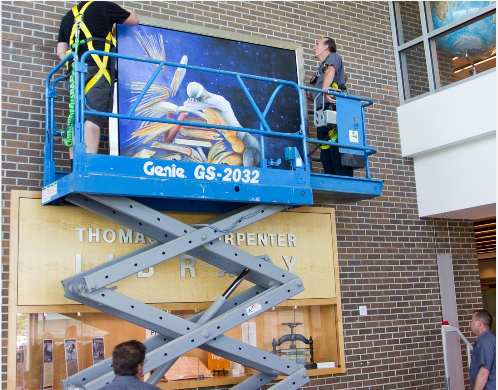
One of several installation days - Personnel from university physical facilities step in to assist a local art installation expert