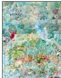
Wet Brenda Adams 2009 Acrylic mixed media Gift of the Artist