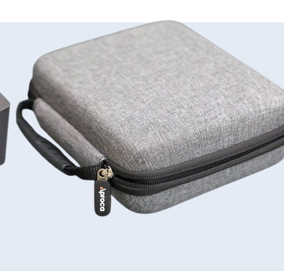
24 Carrying Cases