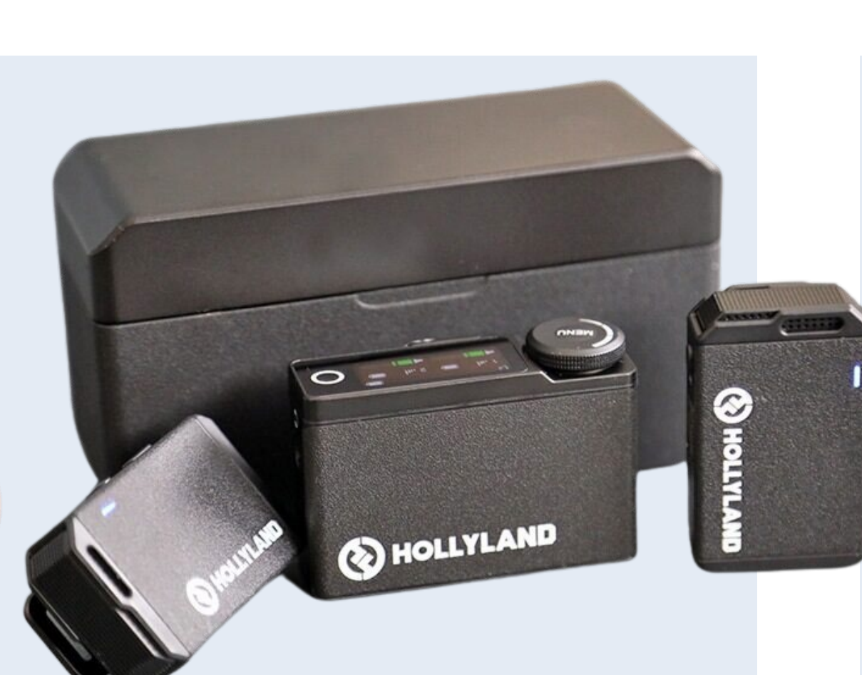
2 Duo-Person Wireless Microphones