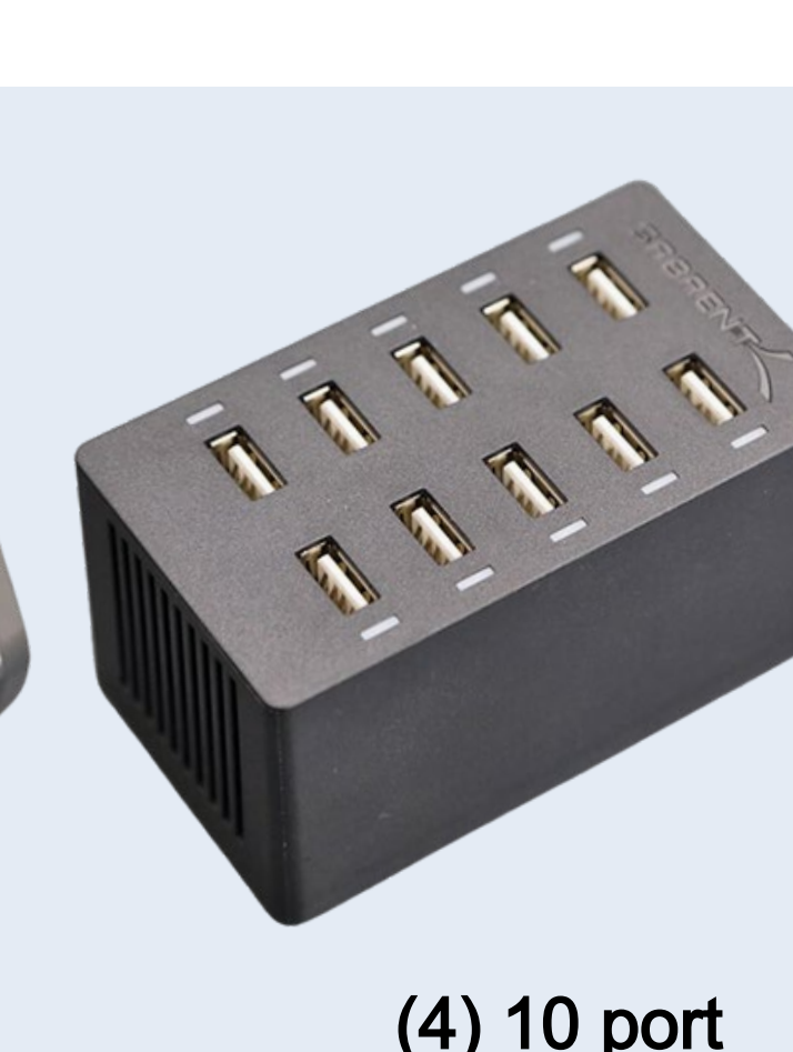
(4) 10 port USB Charger