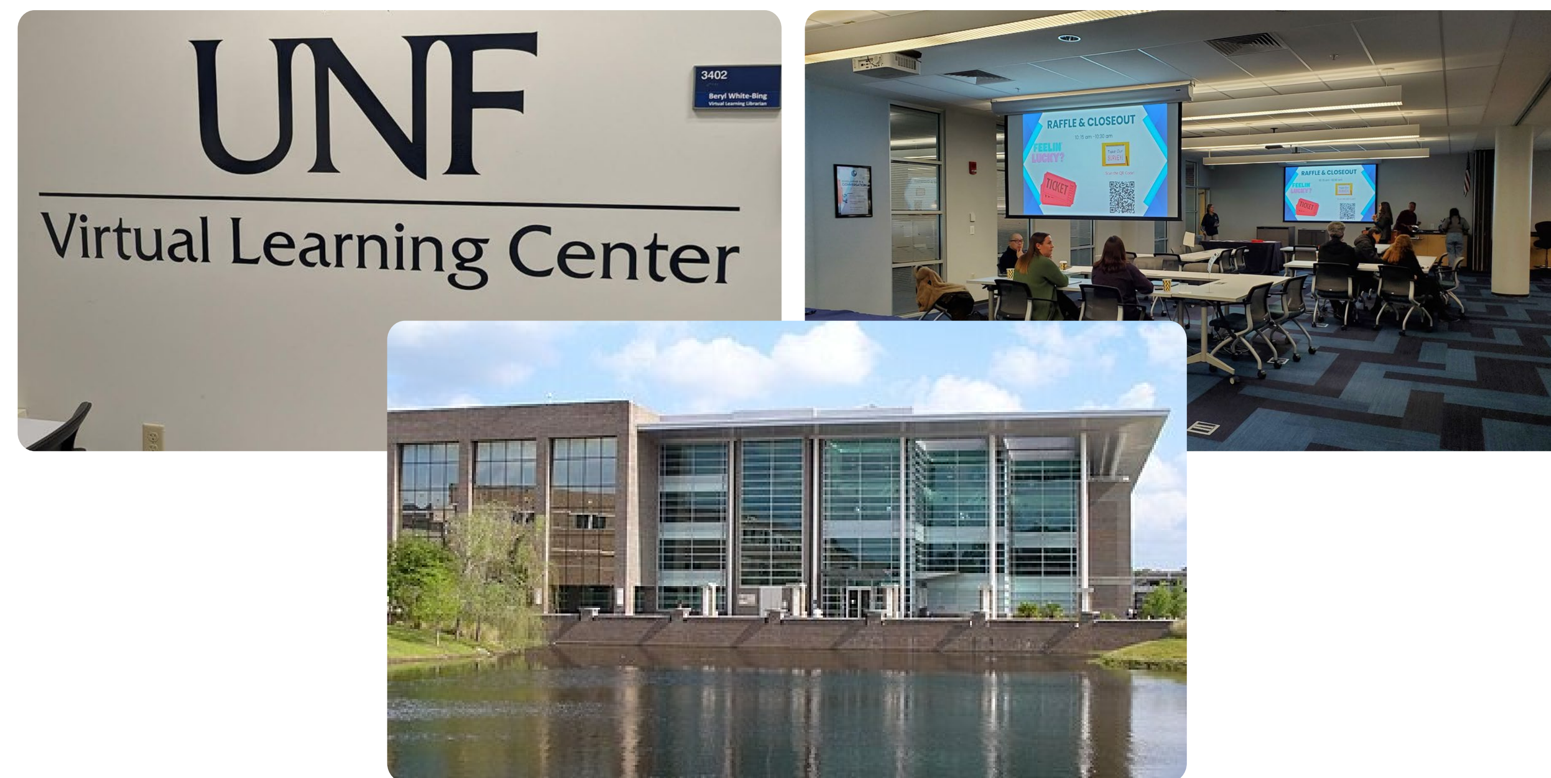
The Can You Hear Me Now? The Power of Sound in Library Instruction project was made possible by funding from the 2024 NEFLIN Innovation Award