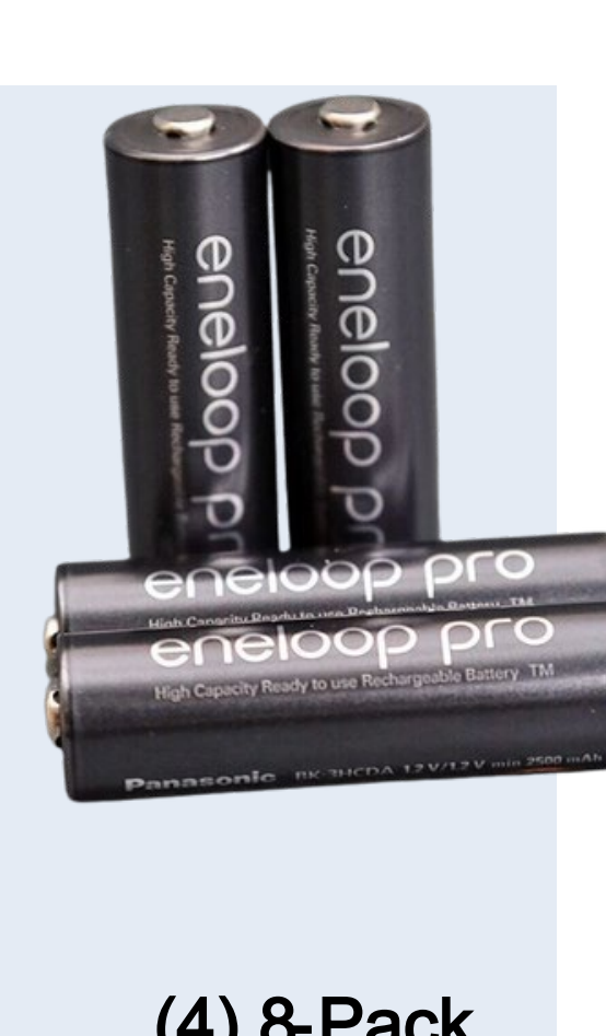
(4) 8-Pack Rechargeable Batteries