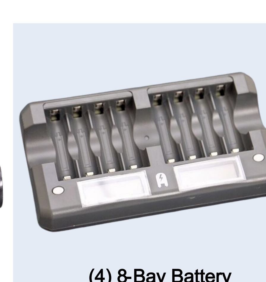
(4) 8-Bay Battery Charging Port