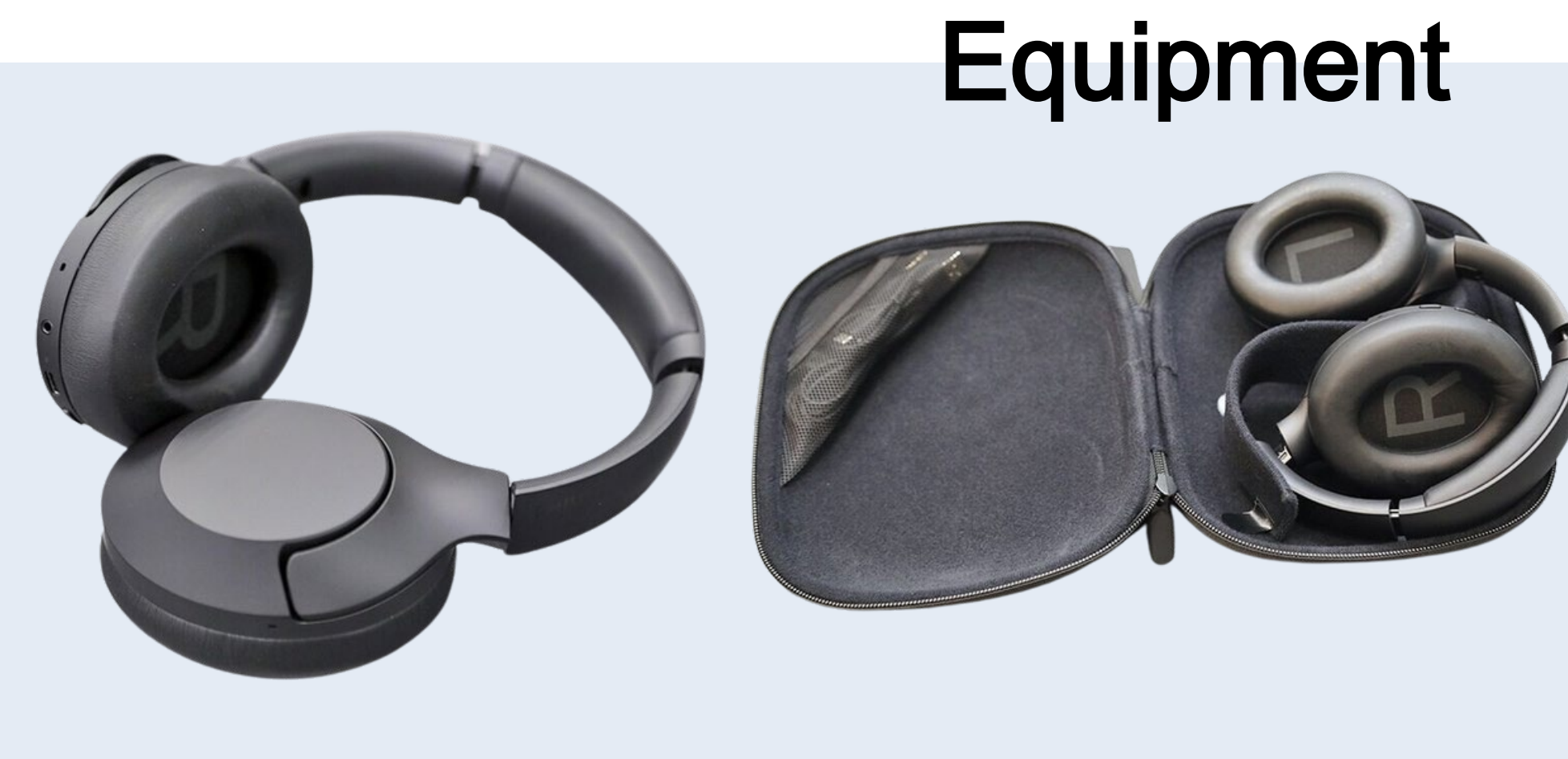
30 Bluetooth Headphones