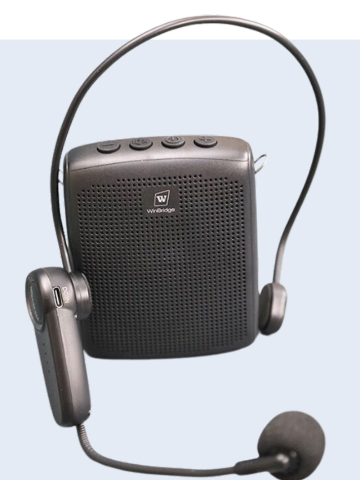
16 Voice Amplifiers