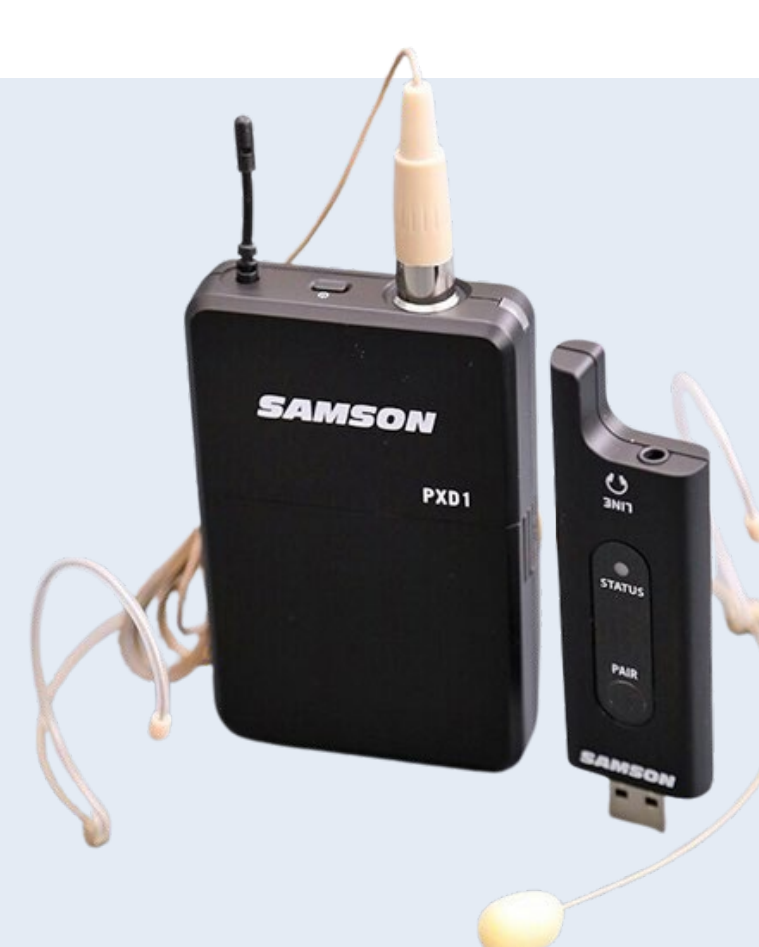
10 Lapel Microphones